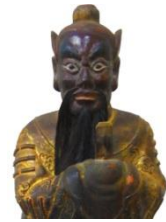
[Right] Ancestral Celestial Master Holding Official's Tablet