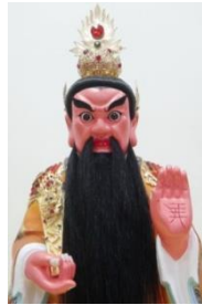
[Right] Ancestral Celestial Master Supporting Three Heavens with His Open Hand