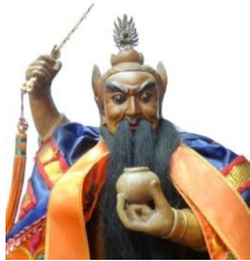
[Left] Ancestral Celestial Master Holding Alms Bowl of Purity