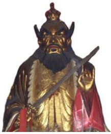
[Left] Ancestral Celestial Master Holding a Sword